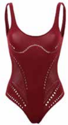
STELLAWEAR BODYSUIT STELLA MCCARTNEY