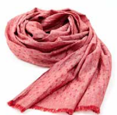
SCARF JOHN VARVATOS