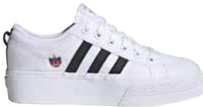
NIZZA PLATFORM SHOES ADIDAS