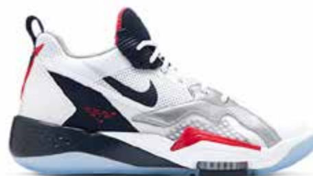
JORDAN ZOOM '92 NIKE