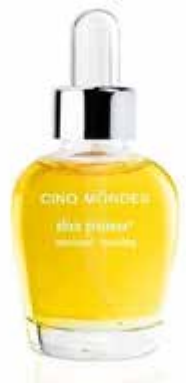
ELIXIR PRECIEUX NOURRISSANT CINQ MONDES - ORLOFF SPA