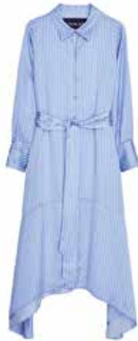
SKY BLUE STRIPE SHIRT DRESS UTERQÛE