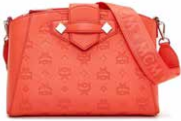
CROSSBODY BAG MCM