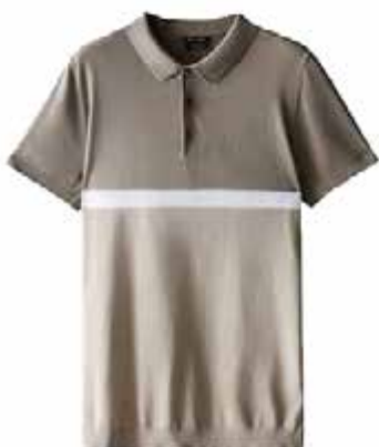
COLOUR BLOCK POLO SWEATER MASSIMO DUTTI