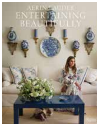
ENTERTAINING BEAUTIFULLY BOOK RIZZOLI