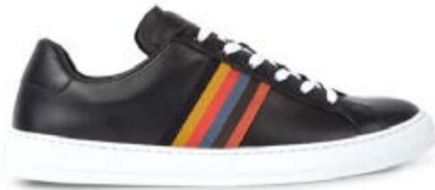
BLACK LEATHER TRAINERS PAUL SMITH