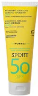
SPORT SUNSCREEN CITRUS SPF50 KORRES