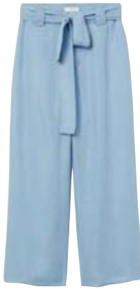
WIDE LYOCELL TROUSERS H&M