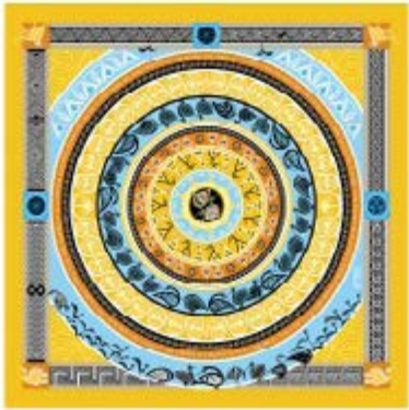
MYCENAEAN SILK SCARF GRECIAN CHIC