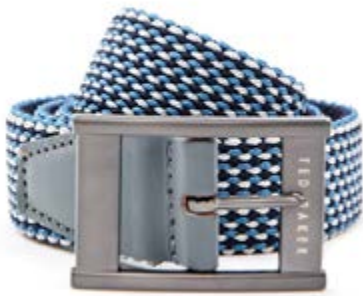
ELASTIC BELT TED BAKER