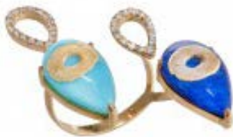
GOLD 18K RING LIANA VOURAKIS