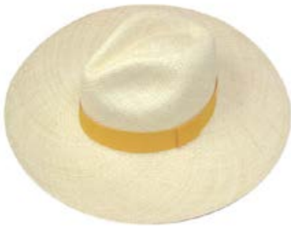
LONG BRIM HAT PANAMA SENSI STUDIO