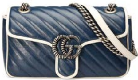
GG MARMONT SMALL SHOULDER BAG GUCCI