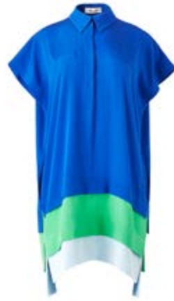
HATSU SILK SHIRT DRESS DVF