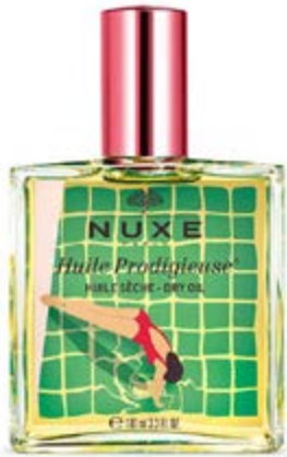
DRY OIL RED LIMITED EDITION NUXE