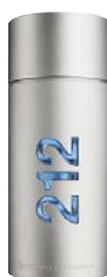
FRAGRANCE 212 NYC CAROLINA HERRERA