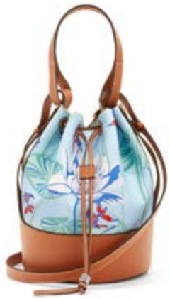
BALLOON BAG LOEWE