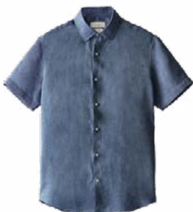
LINEN FADED SHIRT MASSIMO DUTTI