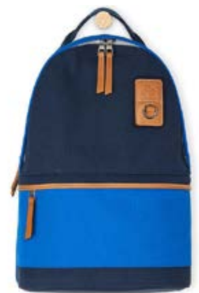
BACKPACK IN CANVAS LOEWE