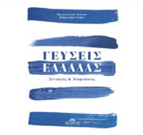
COOKBOOK "A TASTE OF GREECE" MILITOS