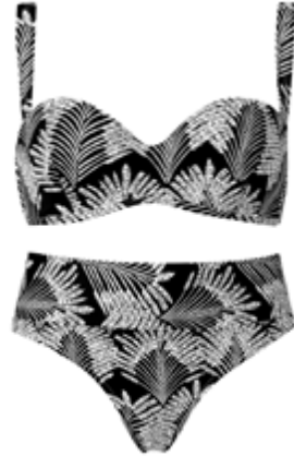
ISIDORA PALMS BLACK STEFANIA FRANGISTA