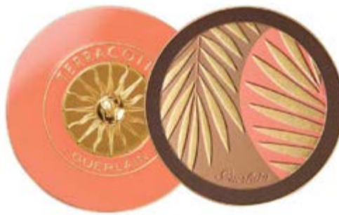
BRONZING AND BLUSH POWDER GUERLAIN