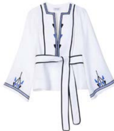
AMORGOS EMBROIDERED BLOUSE ANCIENT KALLOS