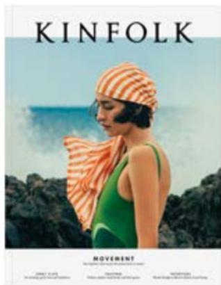
MAGAZINE ISSUE 36 KINFOLK