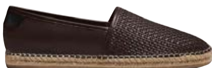
BROWN BRAIDED JUTE ESPADRILLES MASSIMO DUTTI