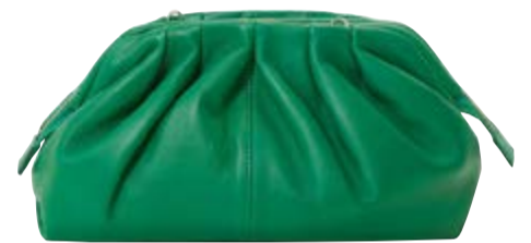
LEATHER MINI HANDBAG UTERQUE