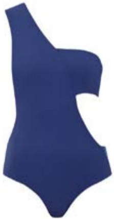
KYTHIRA SWIMWEAR ZEUS + DIONE